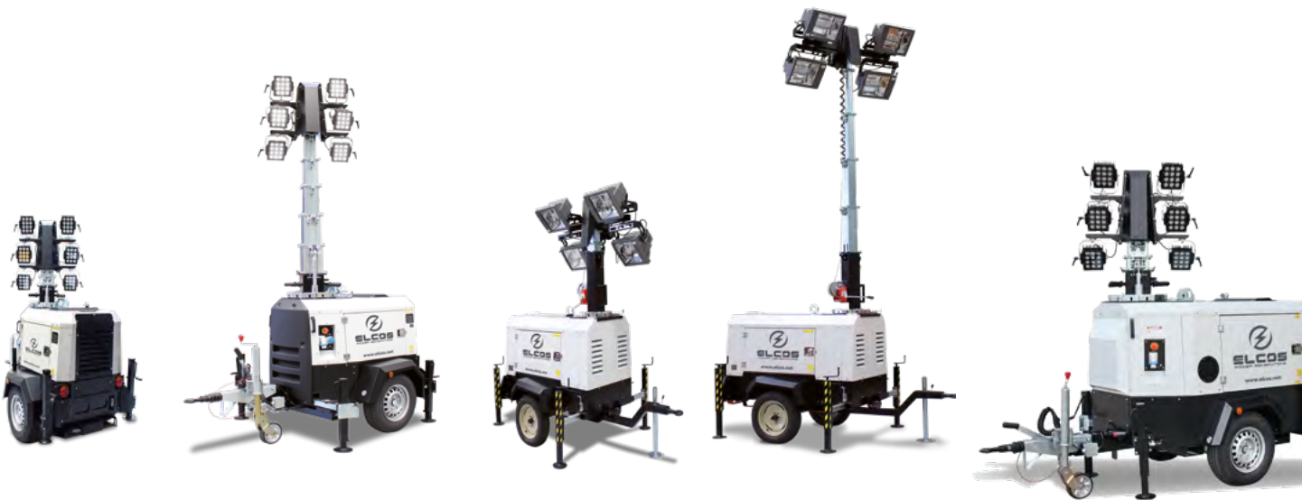
Mobile Lighting Towers with Diesel Generator Torri faro mobili con Generatore Diesel