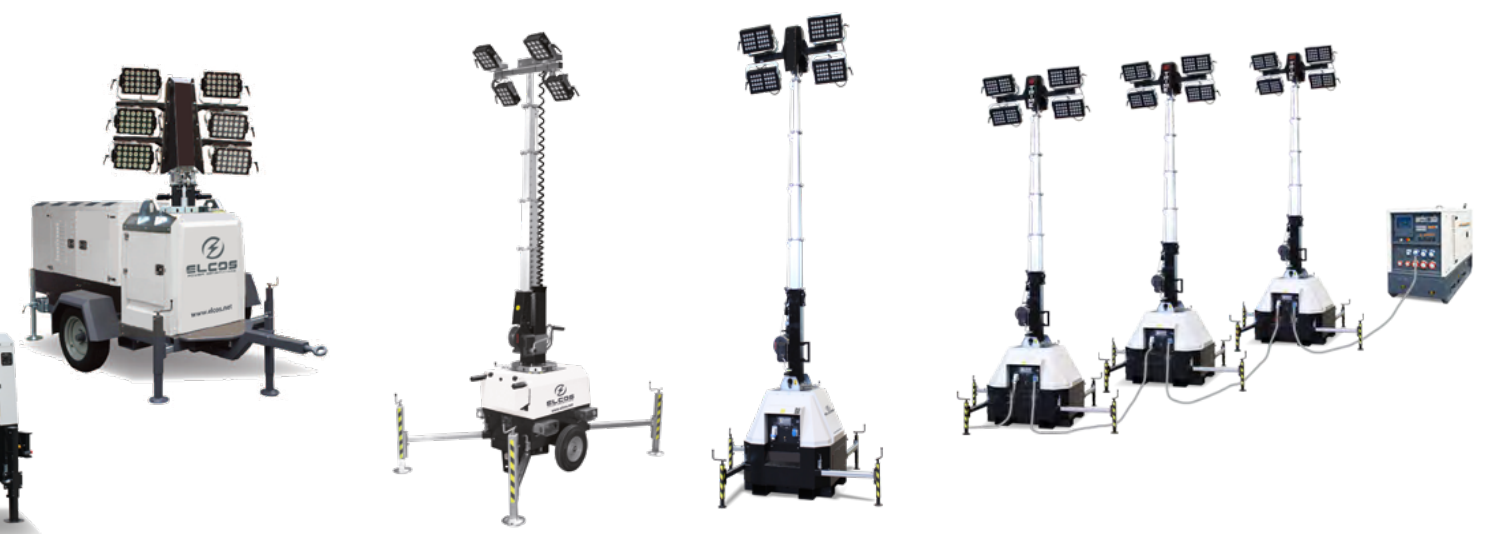
Lighting Towers with Generator Torri faro predisposte per Generatore